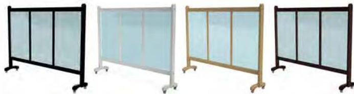
BLACK WHITE NATURAL STAINED

List Price: $962 with casters $907 with glides